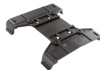
1 x DIN rail mounting bracket