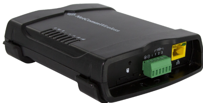
1 x NetComm Wireless 3G M2M Router Plus (NTC-6200)